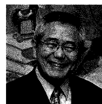
Purdue University Distinguished Professor Mr. Ei-ichi Negishi (Teijin Group Distinguished Fellow) 5th year Teijin Kumura scholarship (1957)

When you find your own "Dream", please challenge it thoroughly until the truth is investigated. I look forward to your great success in the future.