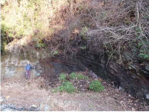
Ogama section, Olenekian and Anisian siliceous claystone and bedded chert sequence.

14: 30 End the excursion at JR Utsunomiya Station