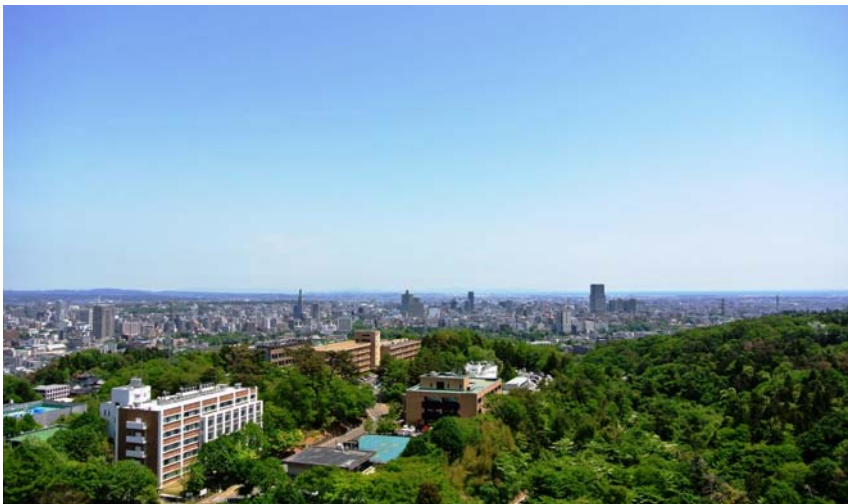
Sendai City from the Faculty of Science, Tohoku University (2015).

Deadline of Early Registration changes by 20th March!