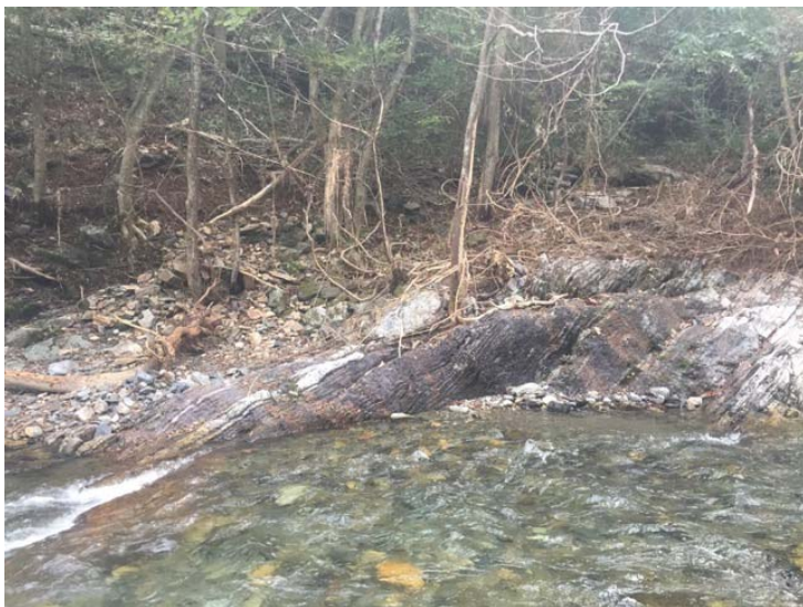
The Upper Carboniferous-Jurassic deep-sea chert at Otori. The approximate base of the chert sequence in the Jurassic accretionary complex of the North Kitakami Belt.