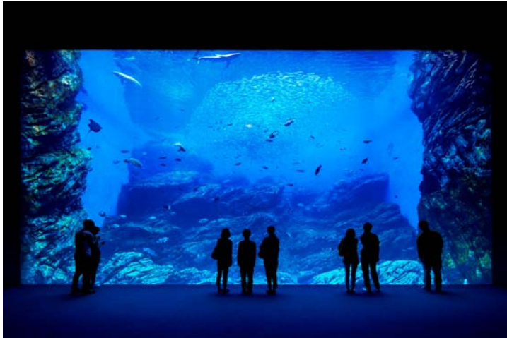
Umino-Mori Aquarium in Sendai City.

*This tour is guided by volunteers for foreign guests from the Sendai Tourism, Convention and International Association.