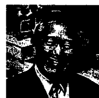
Purdue University Distinguished Professor Mr. Ei-ichi Negishi (Teijin Group Distinguished Fellow) 5th year Teijin Kumura scholarship (1957)

When you find your own "Dream", please challenge it thoroughly until the truth is investigated. I look forward to your great success in the future.