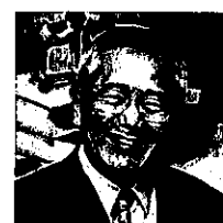
Purdue University Distinguished Professor Mr. Ei-ichi Negishi (Teijin Group Distinguished Fellow) 5th year Teijin Kumura scholarship (1957)

When you find your own "Dream", please challenge it thoroughly until the truth is investigated. I look forward to your great success in the future.