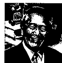
Purdue University Distinguished Professor Mr. Ei-ichi Negishi (Teijin Group Distinguished Fellow) 5th year Teijin Kumura scholarship (1957)

When you find your own "Dream", please challenge it thoroughly until the truth is investigated. I look forward to your great success in the future.