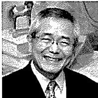
Purdue University Distinguished Professor Mr. Ei-ichi Negishi (Teijin Group Distinguished Fellow) 5th year Teijin Kumura scholarship (1957)

*This message was contributed in November 2013.